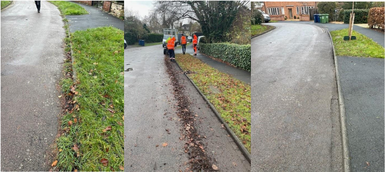
Barton Close before, during and after the use of the proposed new equipment