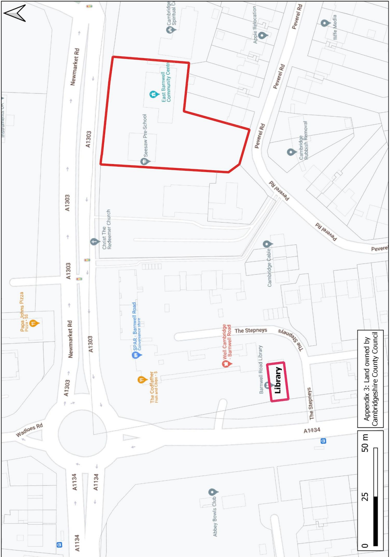
Appendix 3: Land owned by Cambridgeshire County Council