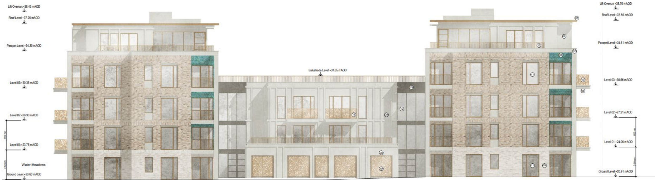
02. Building B West Elevation 4 - 4/03