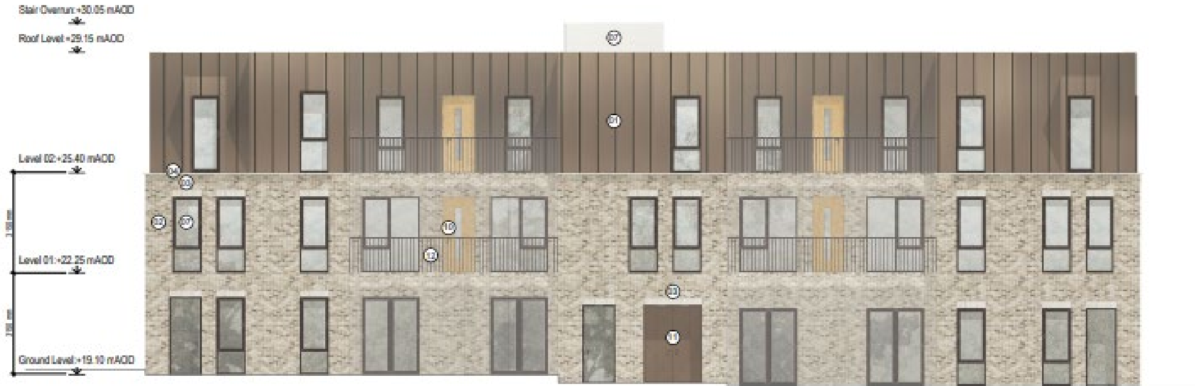
02. Building C East Elevation