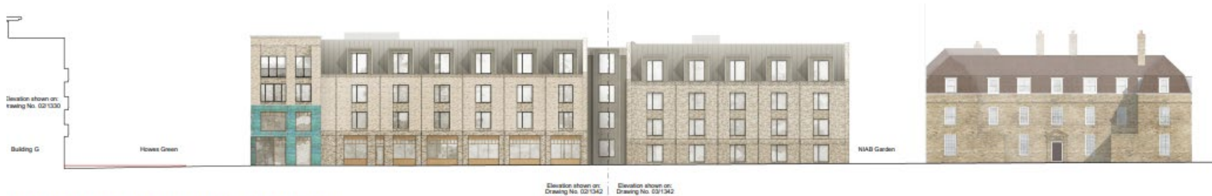
1. Proposed Apart-Hotel West Elevation with NIAB Building