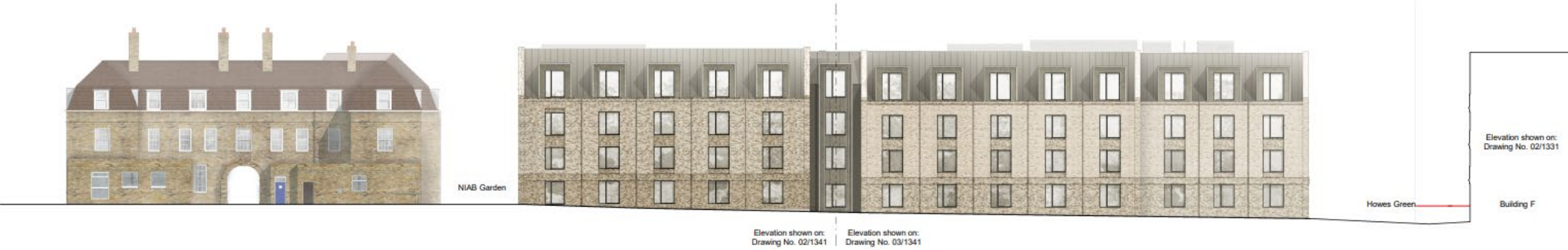
01. Proposed Apart-Hotel East Elevation with NIAB Building