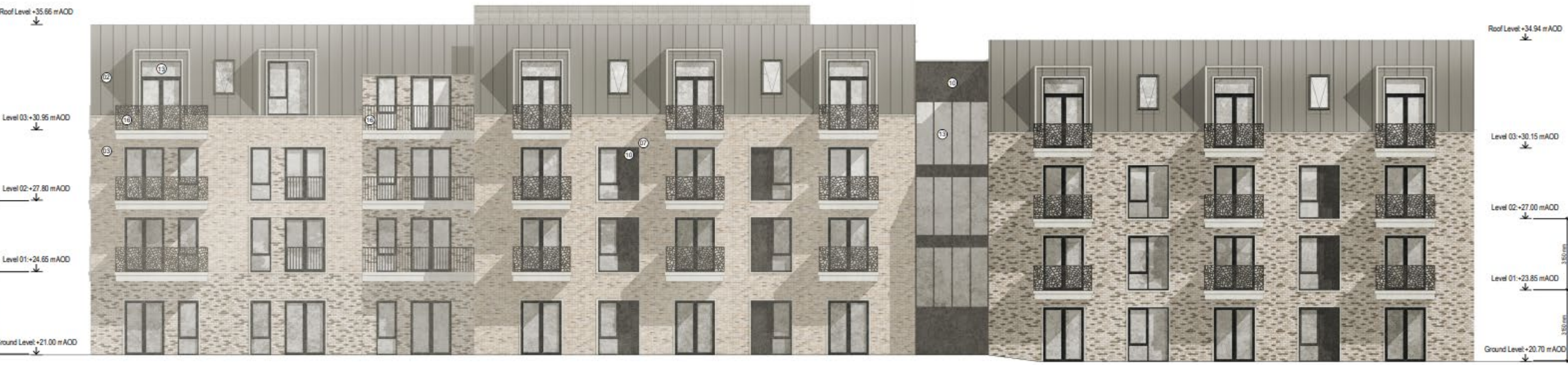
02. Building F & G East Elevation