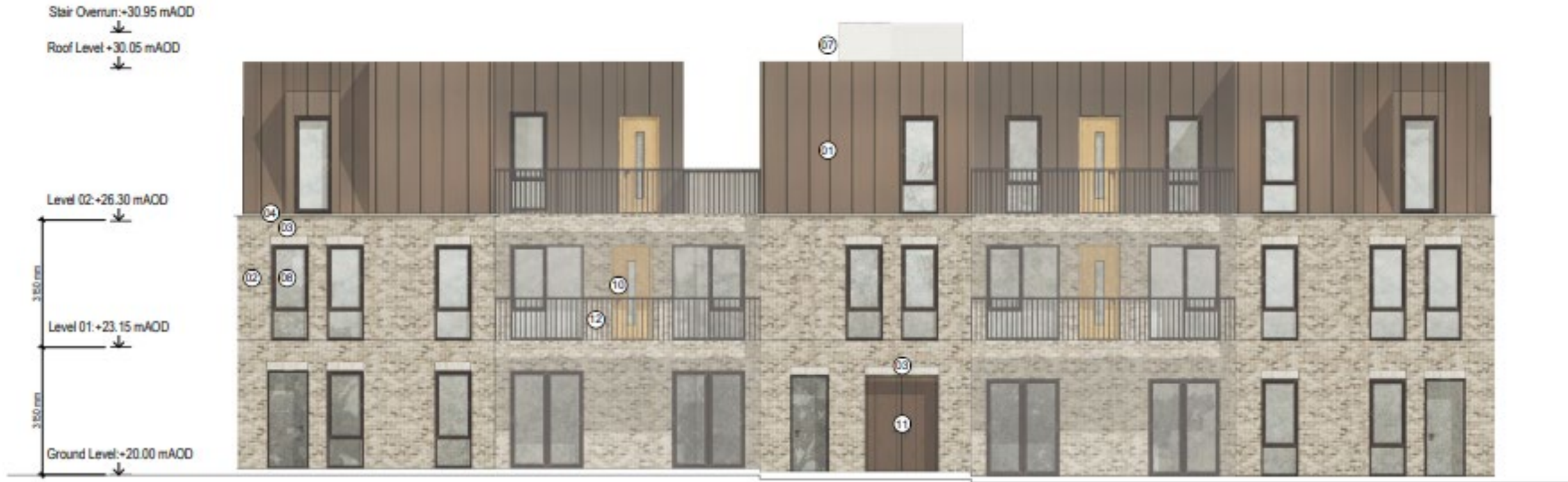
02. Building E East Elevation 1 : 100