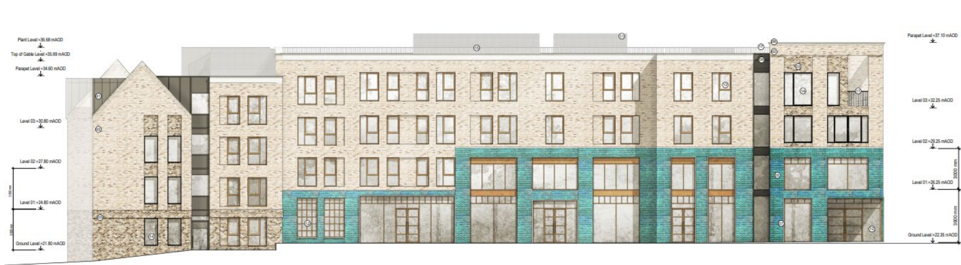
01. Proposed Apart-Hotel North Elevation 1:100