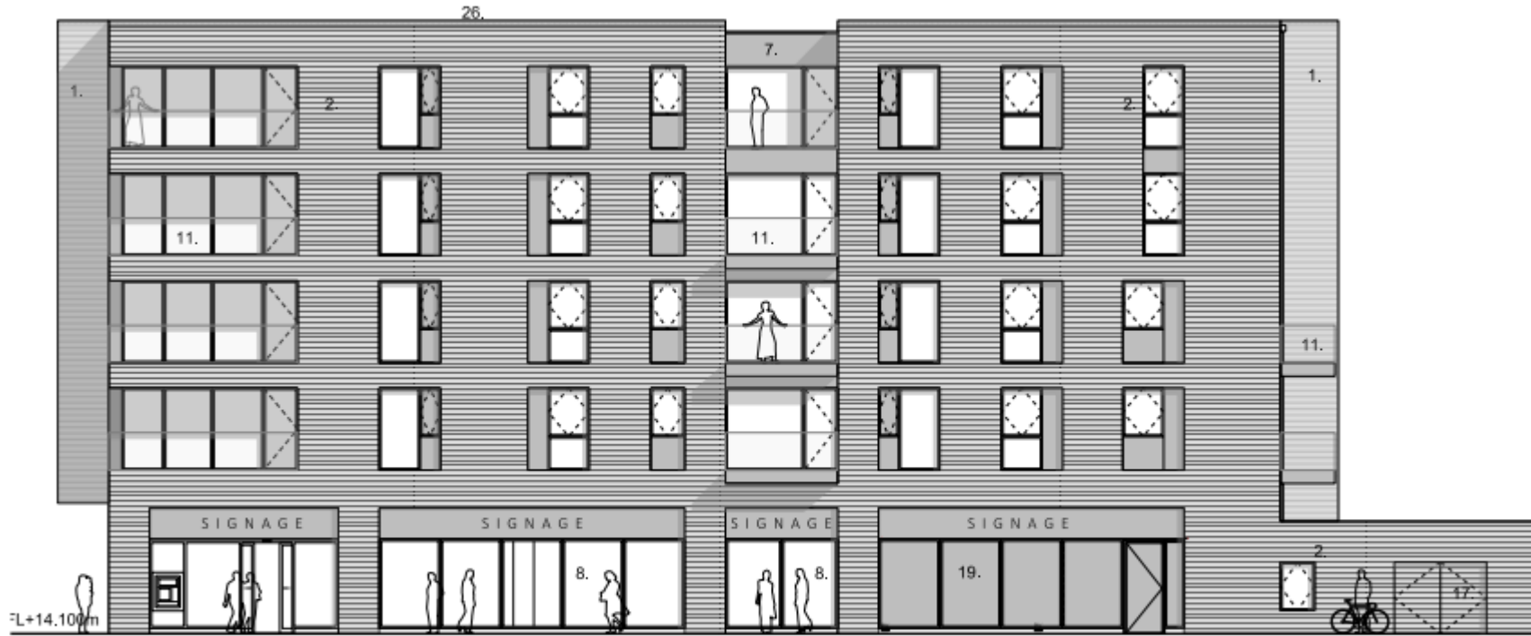
01 Elevation 1

South west elevation facing Hobson's Square