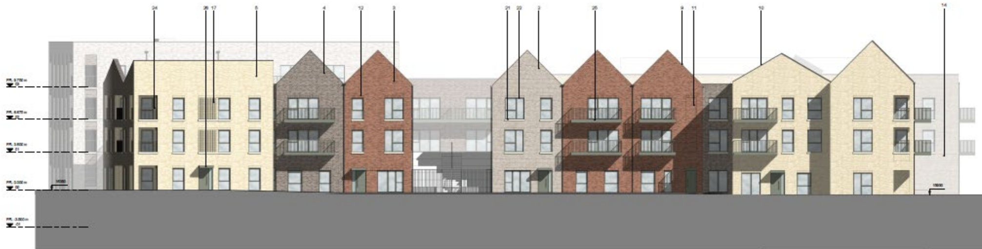
East Elevation 1:100