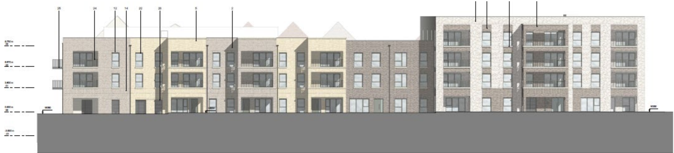
West Elevation 1:100