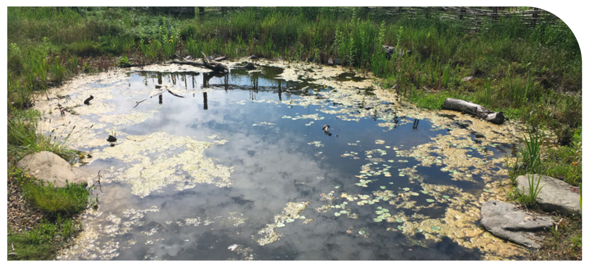
Wildlife Pond at Nightingale Community garden