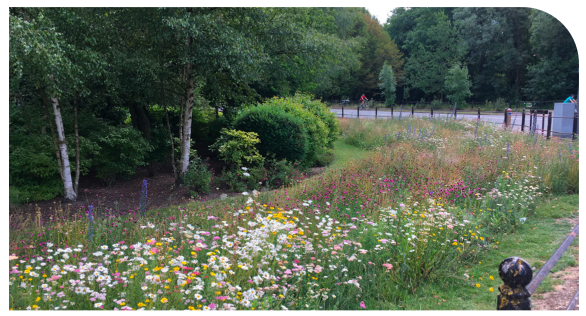
Perennial meadow on Trumpington Road

We hope this guide inspires you to get involved in helping us create and maintain new habitats across the city, both in on our parks and in your gardens and places of work. Based on the guide we would like to hear your ideas for your local parks and open spaces. We will then work with you to consult other park users, secure funding and deliver supported projects.