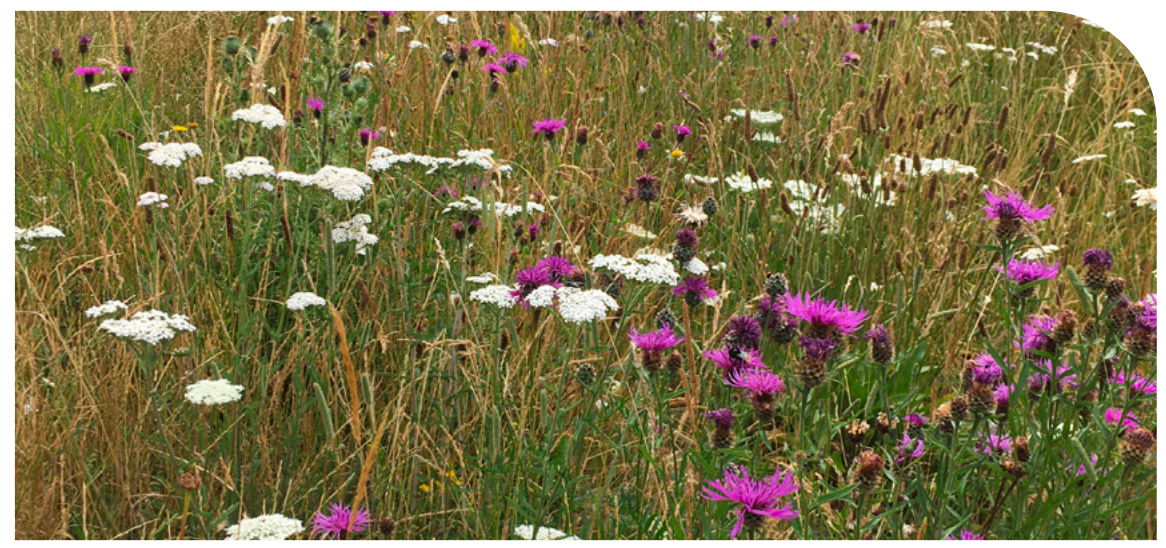
Native Chalk Grassland Creation at Fulbourn Road open space