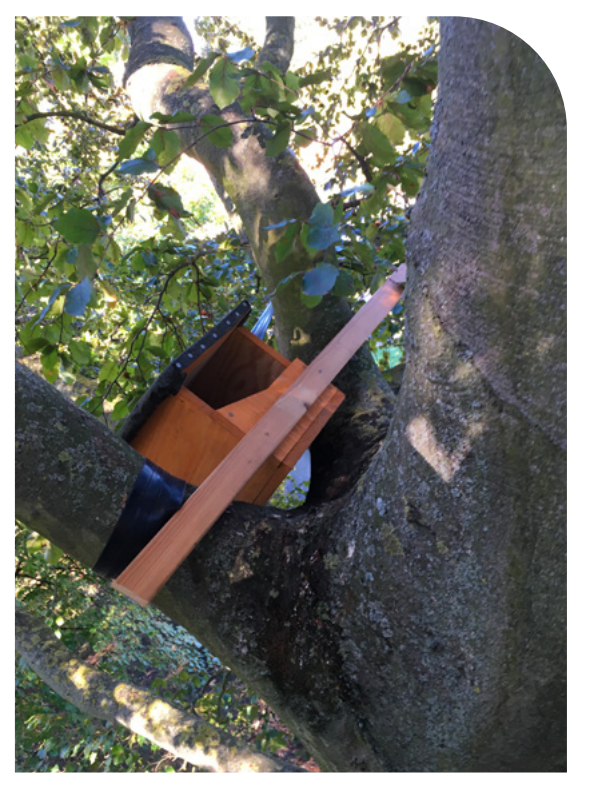
Tawny Owl box at Christ's Piece