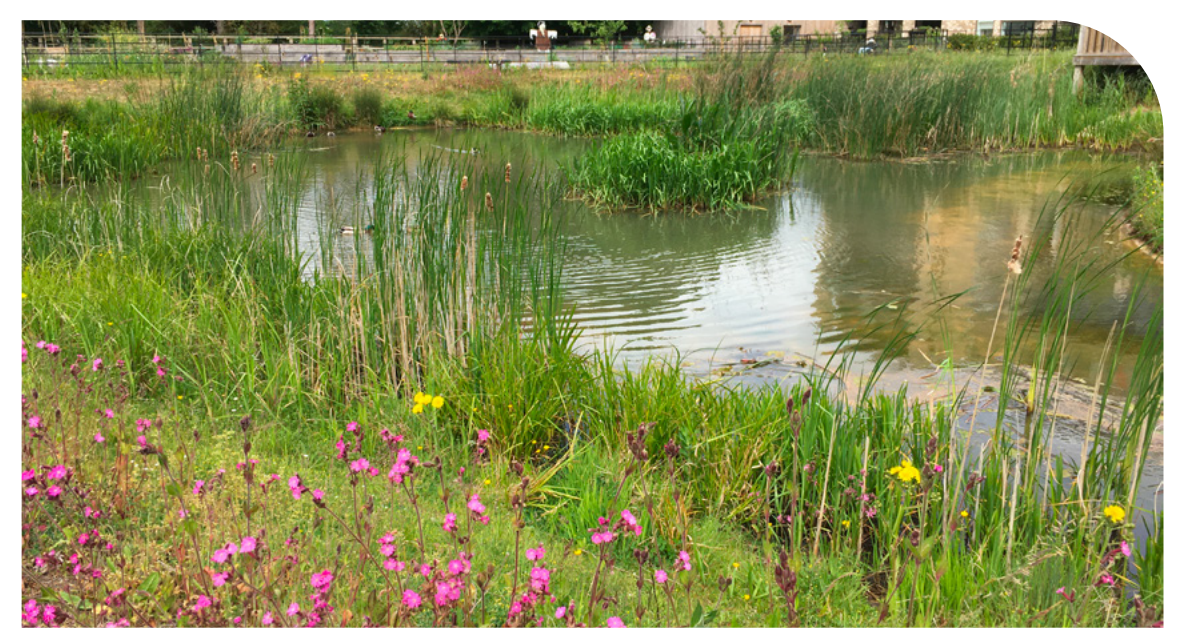
Recently created pond at Nine Wells

Once you have an area in mind we can work with you to assess its suitability and check no existing biodiversity will be negatively impacted.