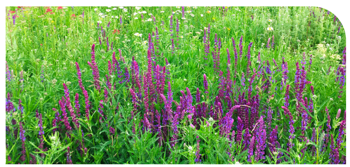
Perennial flowering meadow at Cherry Hinton Hall

We hope this guide will be useful for City Council Community Engagement and Operations staff and especially for people who already volunteer with them – or who might consider it in the future.