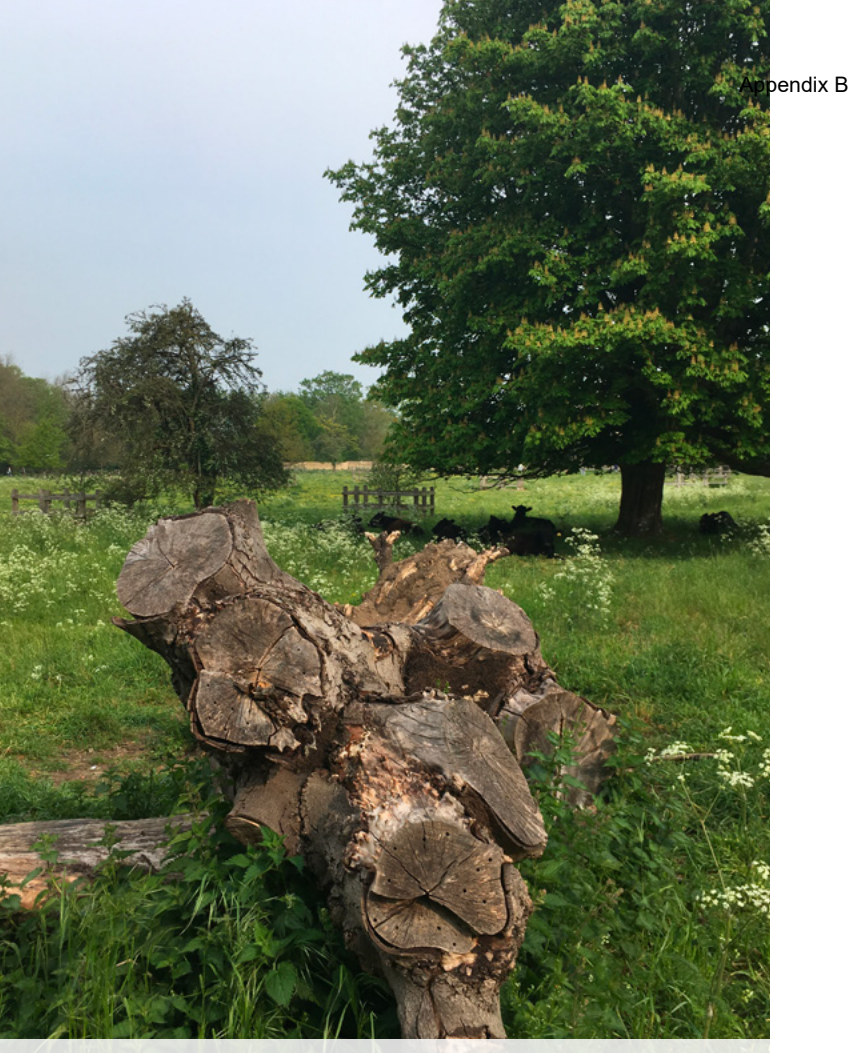
Felled timber left for insects and a cattle scratching post on New Bit