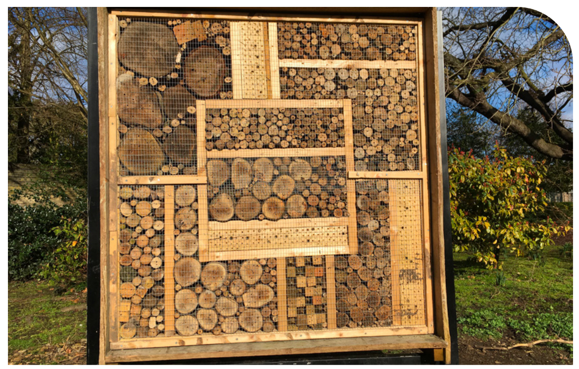
Solitary bee hotel at Christ's Pieces