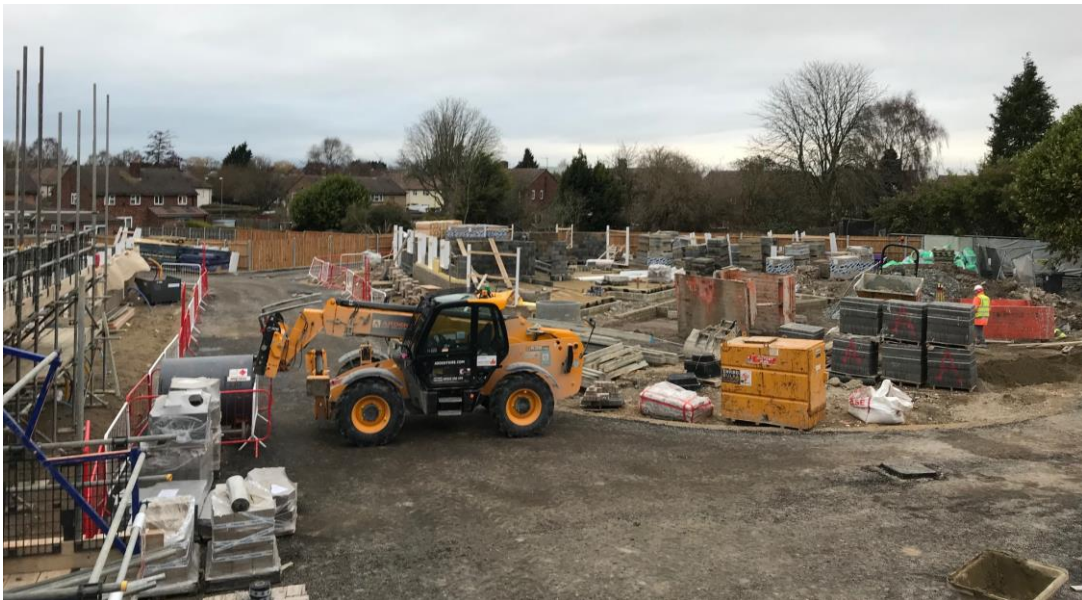
Ventress Close, January 2020