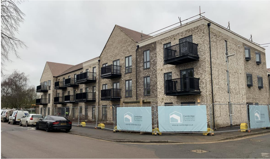
Anstey Way, January 2020