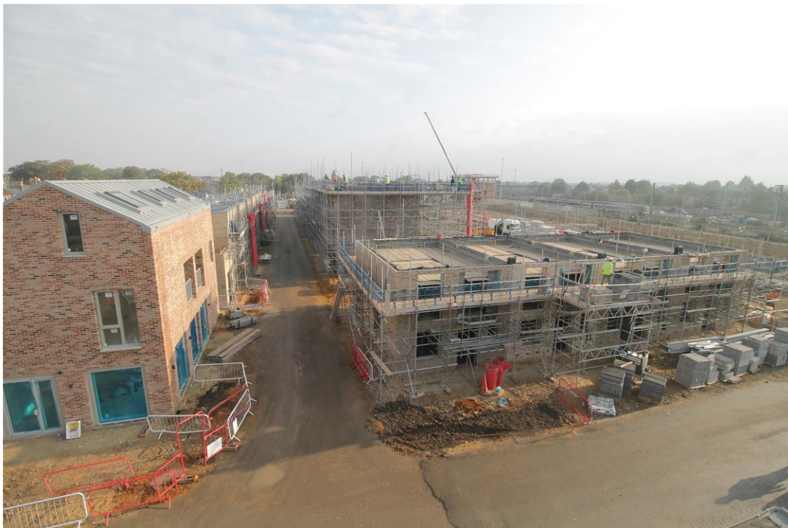
Mill Road, October 2019