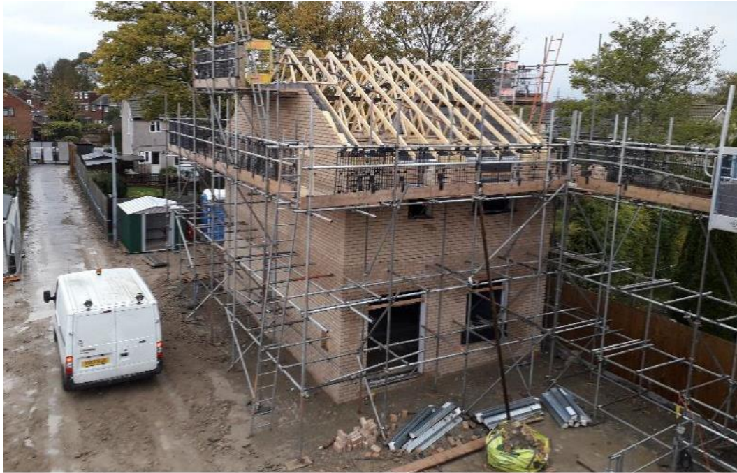
Colville Road garages, November 2019