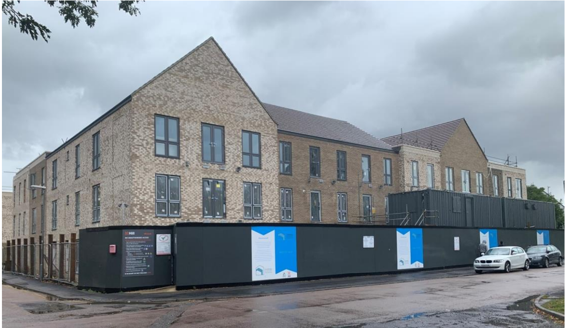
Anstey Way, November 2019