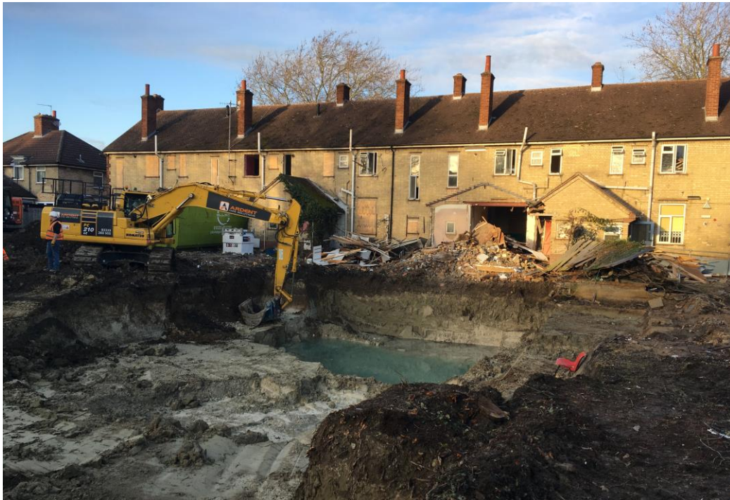
Akeman Street, December 2019