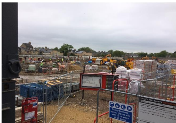
General View over the site towards Houses