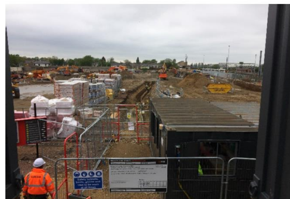
General View towards Flat Basement excavation