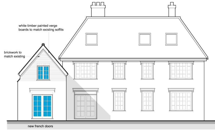
Proposed SW Facing Elevation 1:100