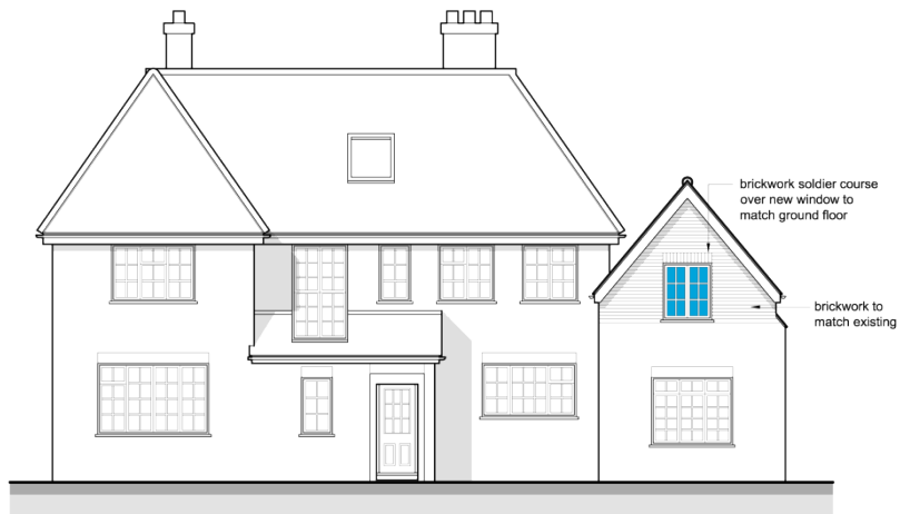
Proposed NE Facing Elevation 1:100