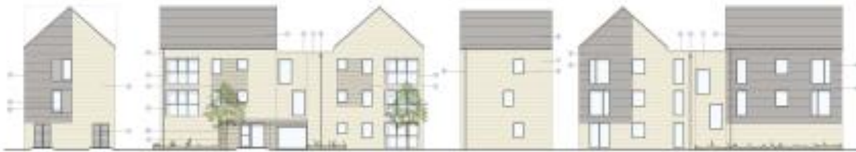
2. South Elevation