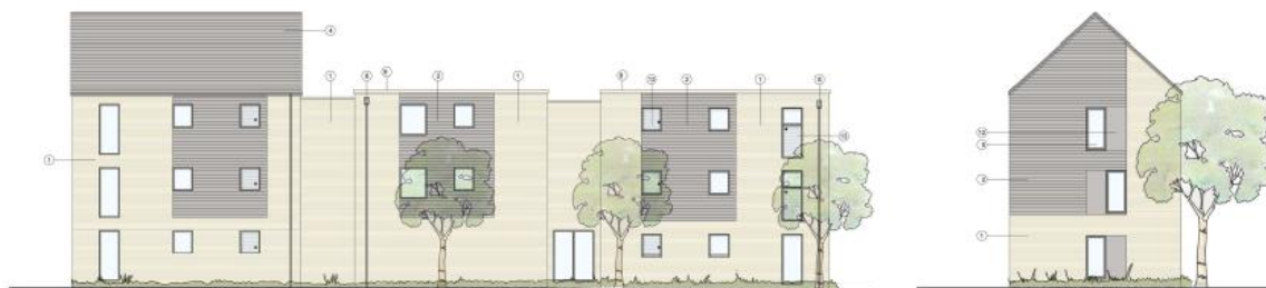
3. East Elevation