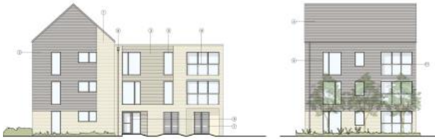
1. South Elevation