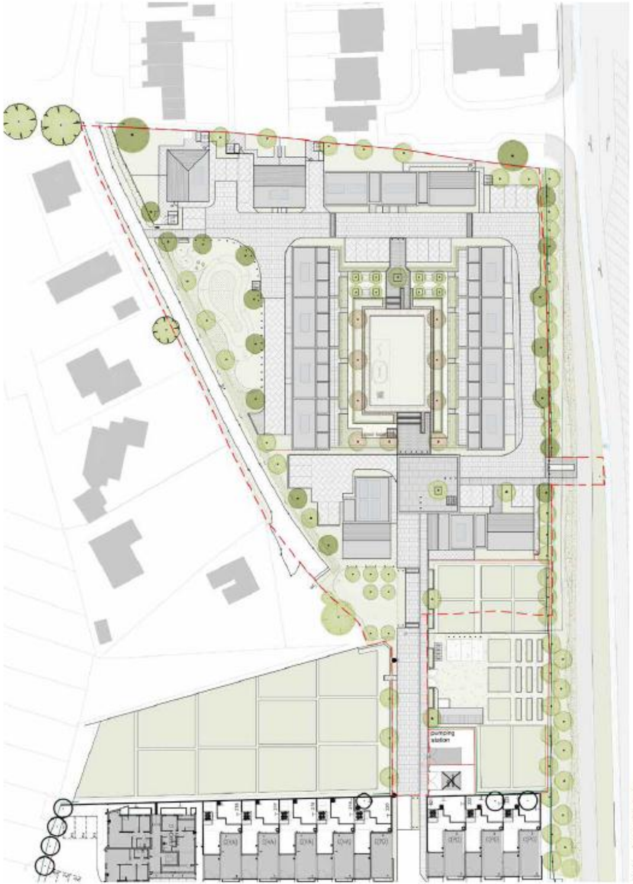
Fig. 2: Proposed Site Layout