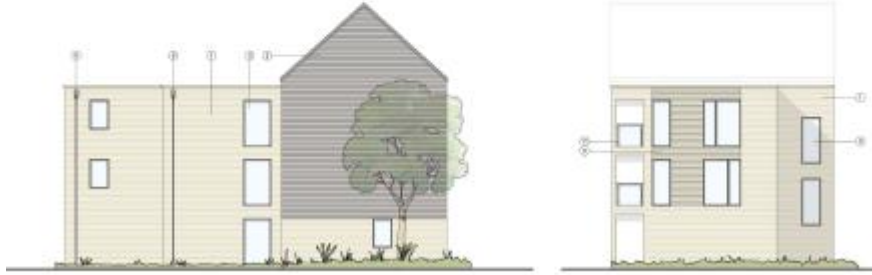
3. North Elevation