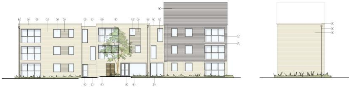
1. West Elevation