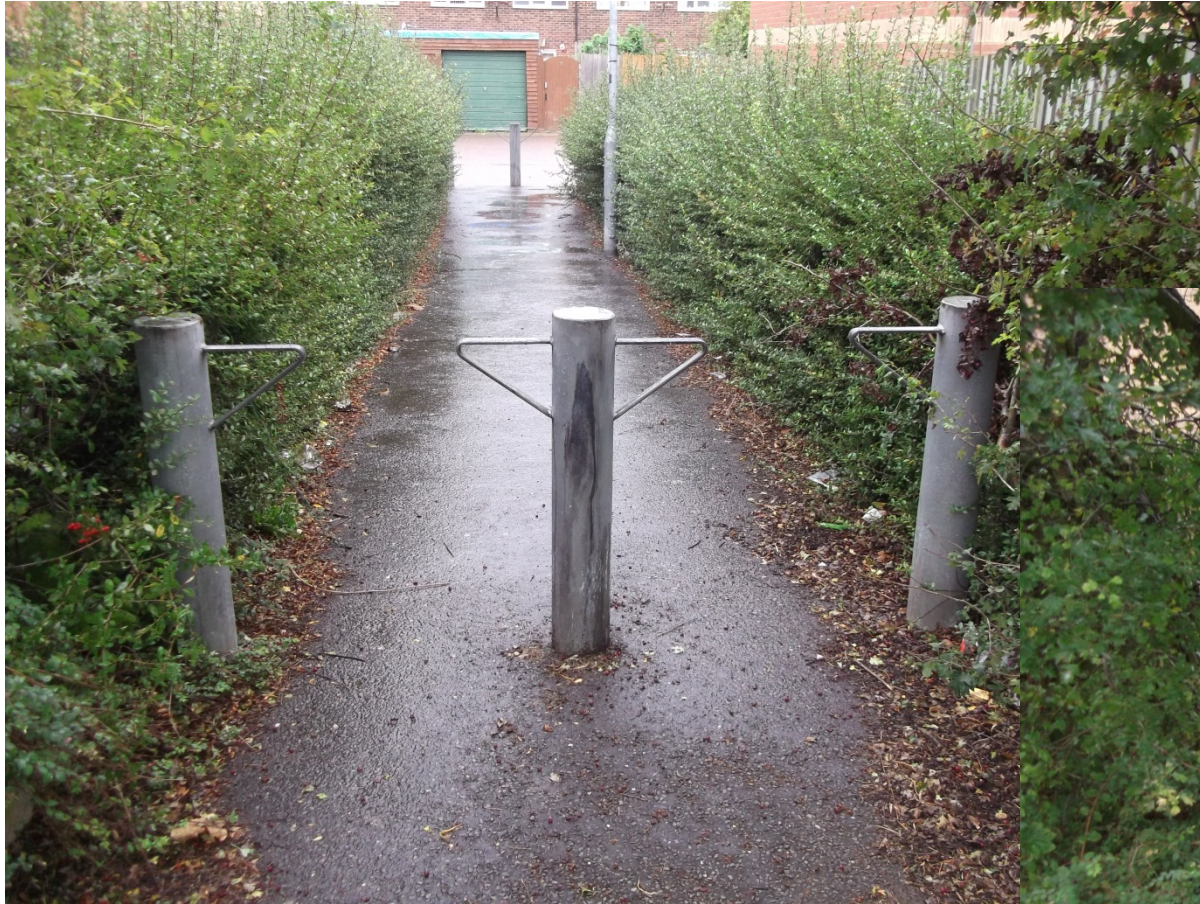
Photographs of vegetation cut back on Nuns Way Recreation Ground footpath to Blackberry Way: Before and after (November 2014)