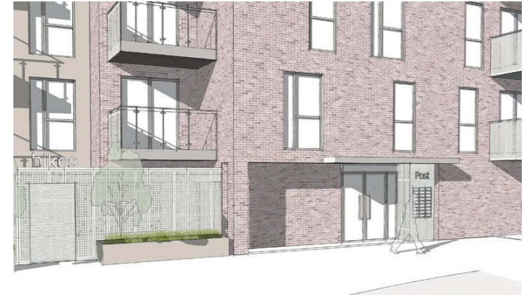
View 1: Block D1 entrance