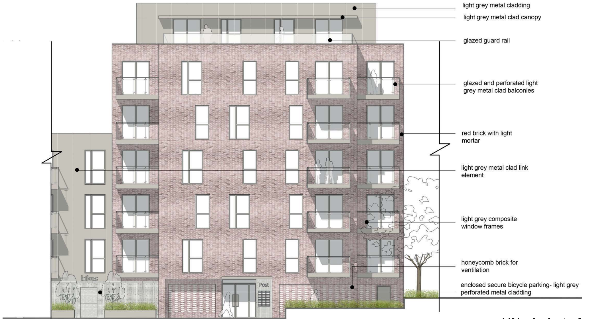
Representative elevation bay study