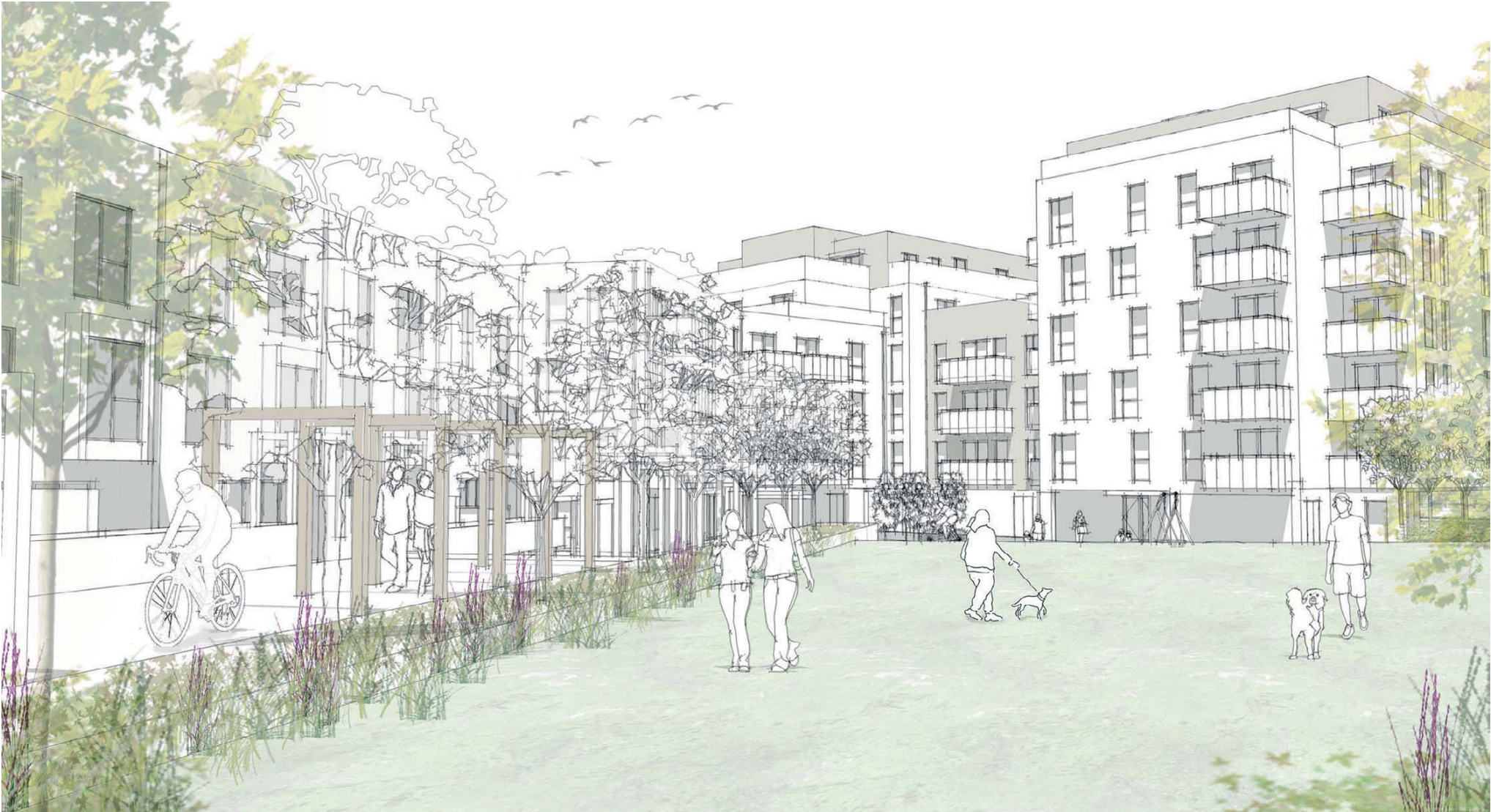
View E: Central amenity space