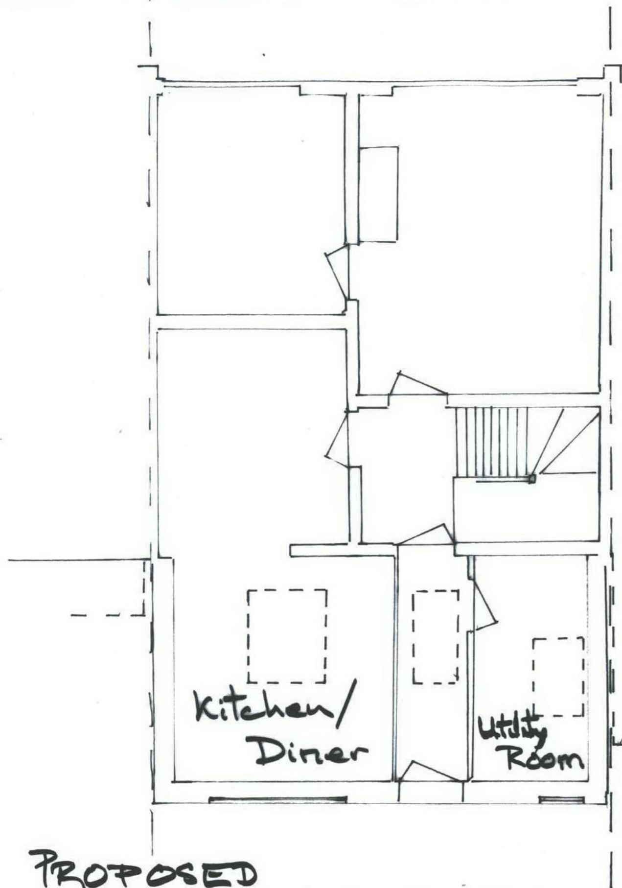
PROPOSED GROUND FLOOR PLAN 1:50