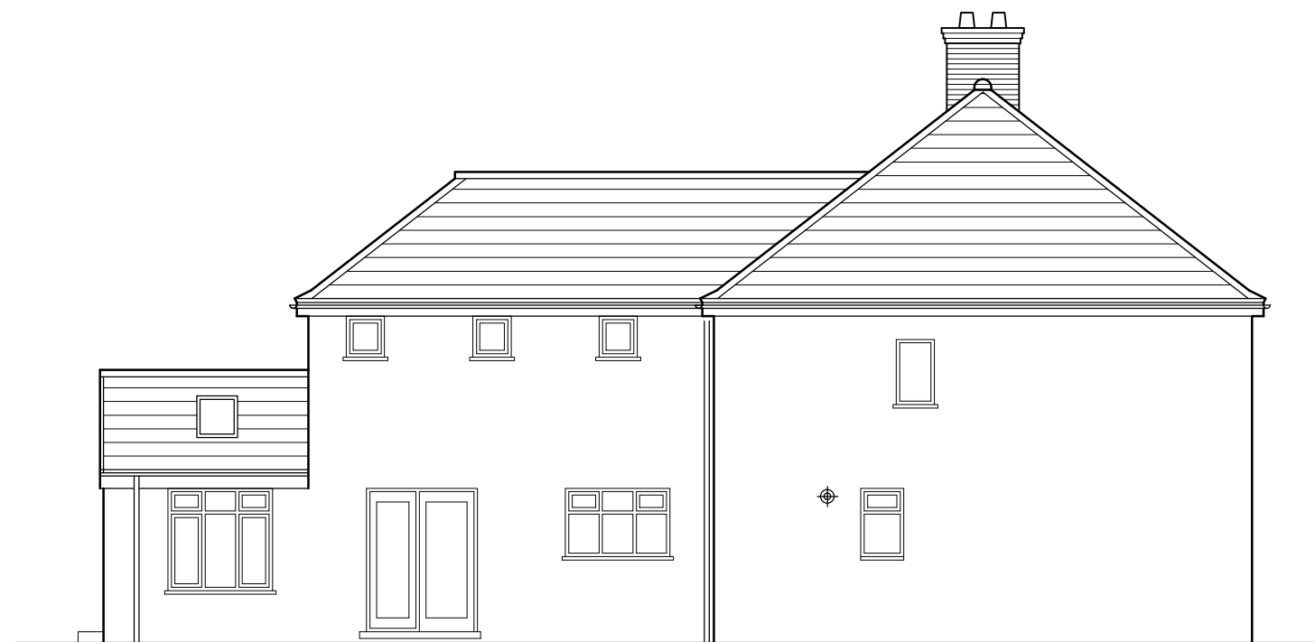
South Elevation as Proposed