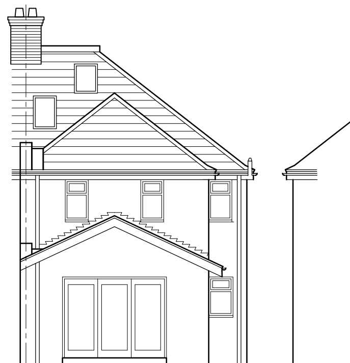
West Elevation as Proposed