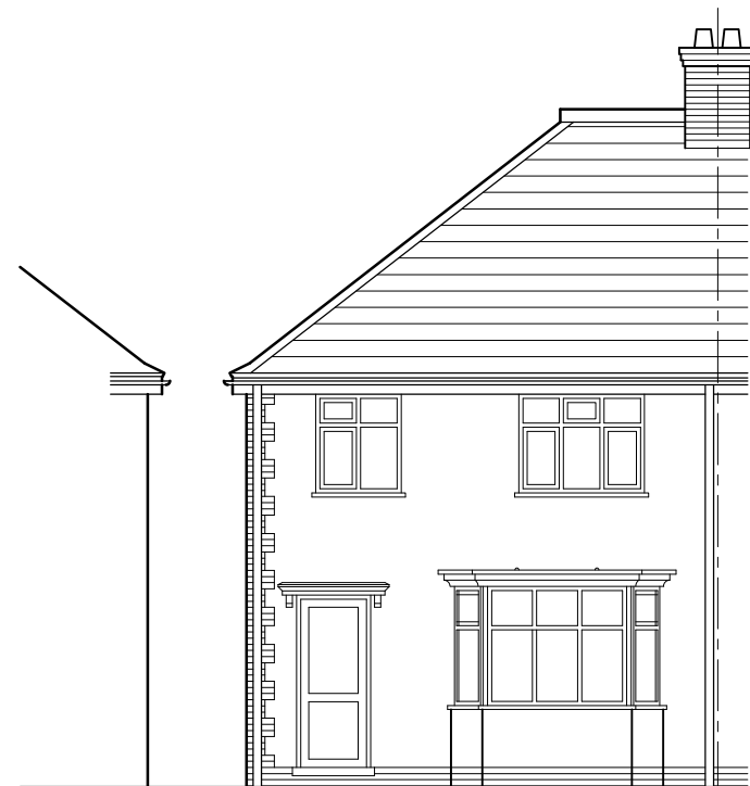
East Elevation as Proposed