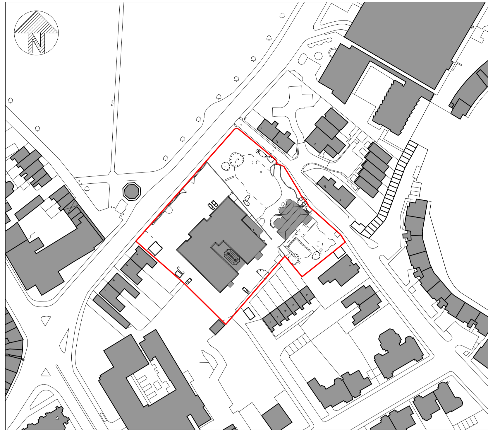
EXISTING LOCATION PLAN SCALE 1:1250