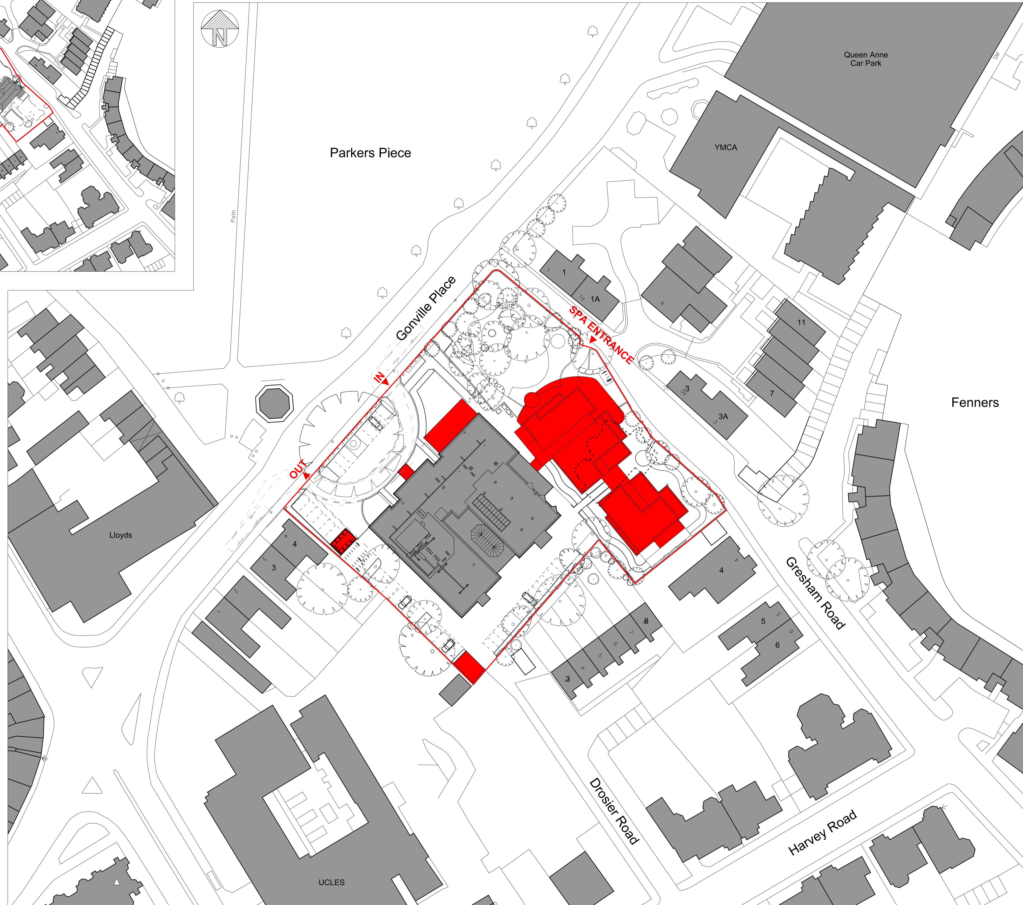
PROPOSED BLOCK PLAN SCALE 1:500