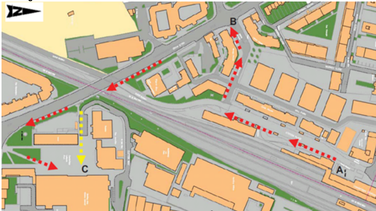
Drawing 1 - Current Route from Central Station to Cinema Doors