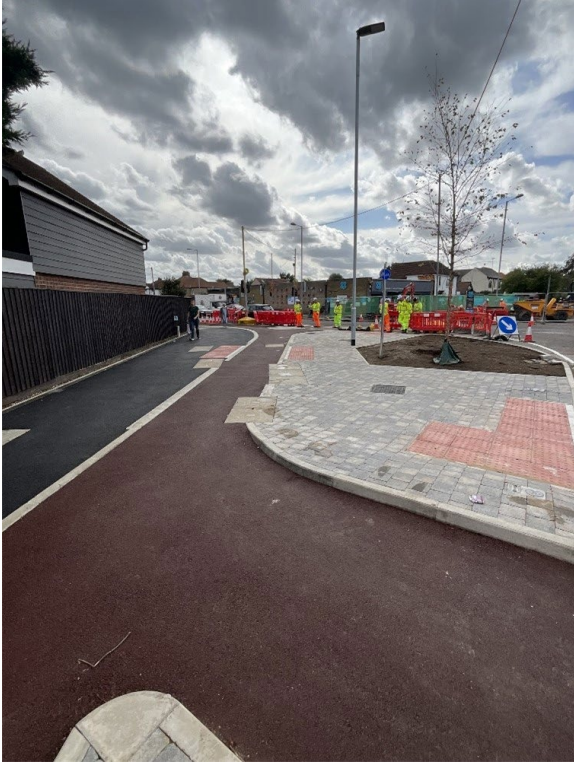
Kings Hedges NE Quadrant