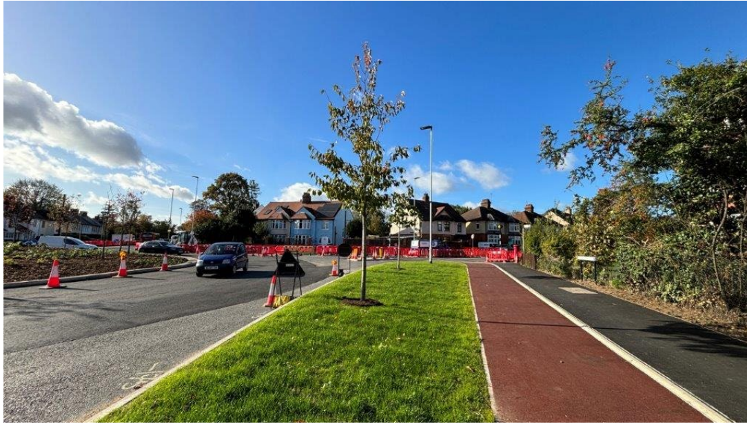
Roundabout NW quadrant