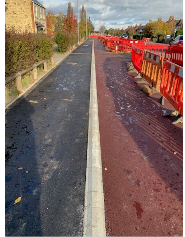
Opposite Fraser Road looking North