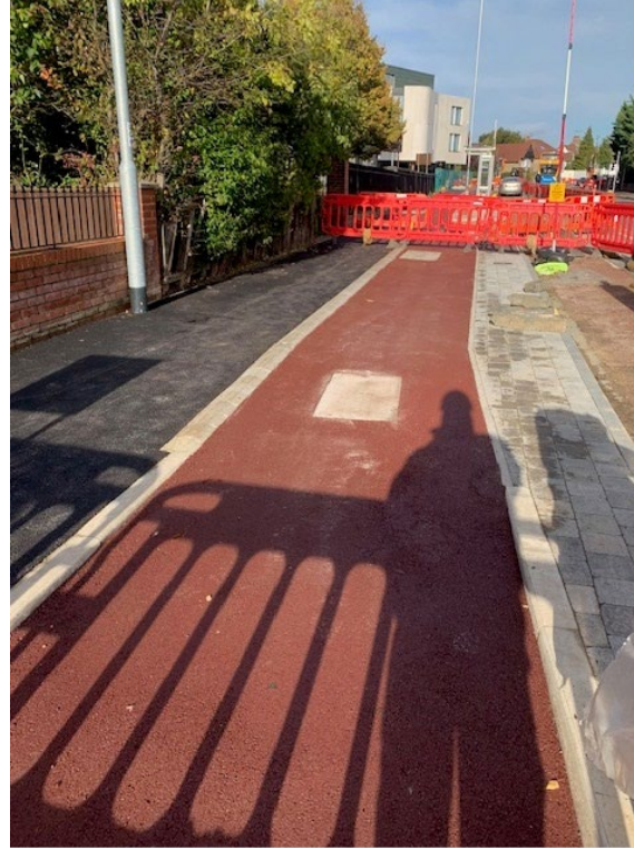
Southern section at Mitcham's Corner western side